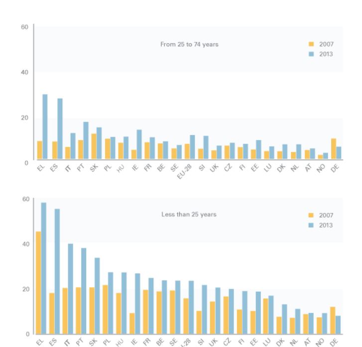
Figure 1 Unemployment rates by age group in selected European countries (2014)